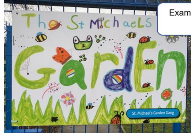
Example of a sign from a local school