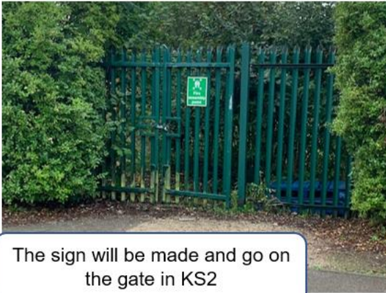
The sign will be made and go on the gate in KS2